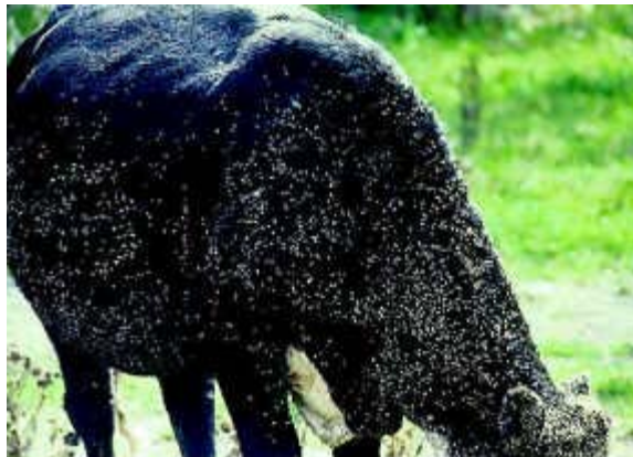
Seeds easily attach to passing animals