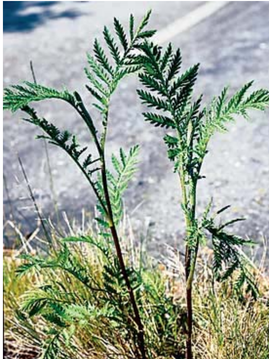
Seedling leaves with serrated leaflet margins