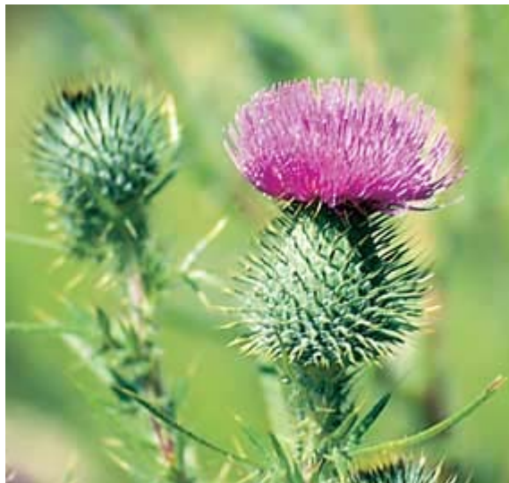
Spine-tipped flowerhead bracts