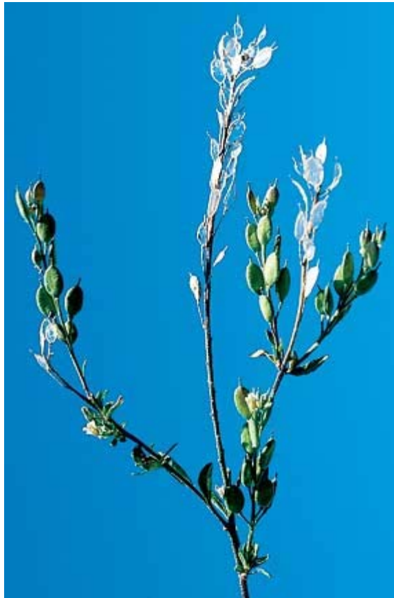
Flattened seedpods held close to the stem