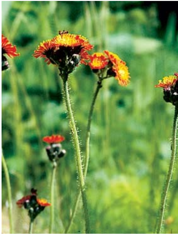
Orange hawkweed with stiff, glandular hairs