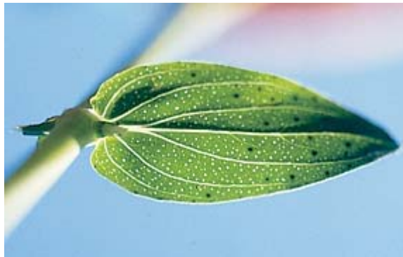
Transparent dots on leaves contain a photosensitizing pigment