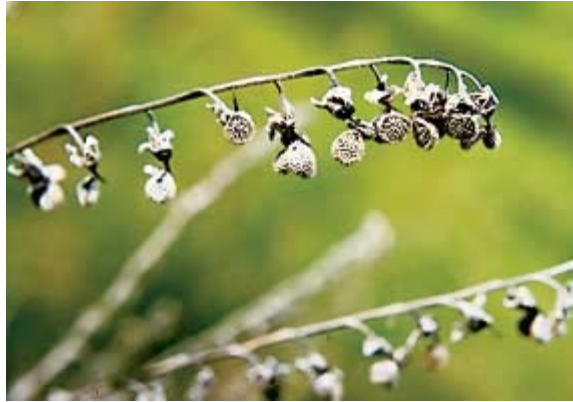
Each flower produces 4 burred nutlets (seeds)