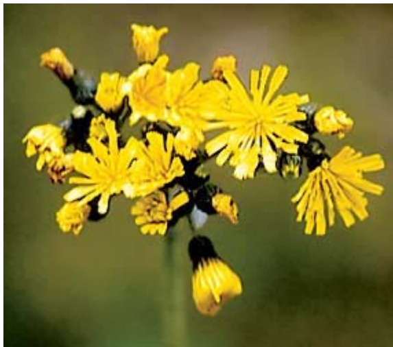
Yellow hawkweed flower