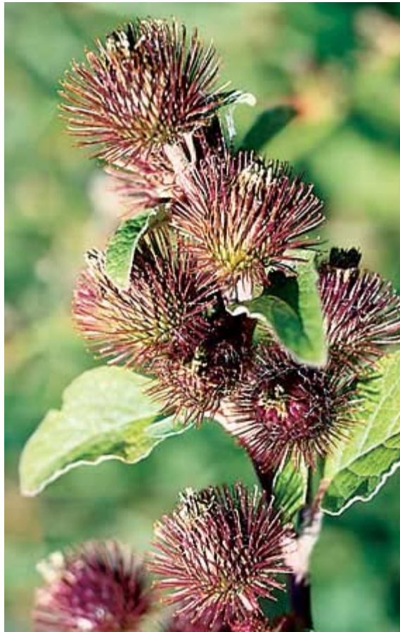
Flowerhead bracts with hooked spines

Horsetail Hound's-tongue Japanese Knotweed Jointed Goatgrass Kochia Lady's-Thumb Lamb's-Quarters Leafy Spurge Marsh Plume Thistle Meadow Knapweed Milkweed Mullein Night-Flowering Catchfly Nightshade Nodding Thistle Nod. Beggar-Ticks Orange Hawkweed Oxeye Daisy Perennial Pepperweed Pigweed Pineappleweed Plantain Plumeless Thistle Puncturevine Purple Nutsedge Purple Loosestrife Quackgrass Rush Skeletonweed Russian Knapweed Russian Thistle Scentless Chamomile Scotch Broom Scotch Thistle Sheep Sorrel Shepherd's Purse Sow-thistle Spotted Knapweed St. Johns-Wort Stinkweed Sulphur Cinquefoil Tansy Ragwort Velvetleaf Water Hemlock White Cockle