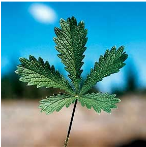
Palmate leaf with 5 to 7 leaflets